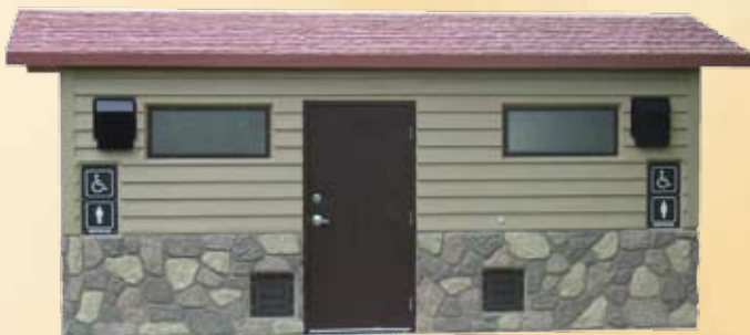
*Shown with optional horizontal lap and Napa Valley Rock textured walls, and standard cedar shake roof

We at CXT take pride in our craftsmanship and are ready to provide you with our legendary customer service. See why we say, "Once you buy a CXT produced building you will never purchase anything else."