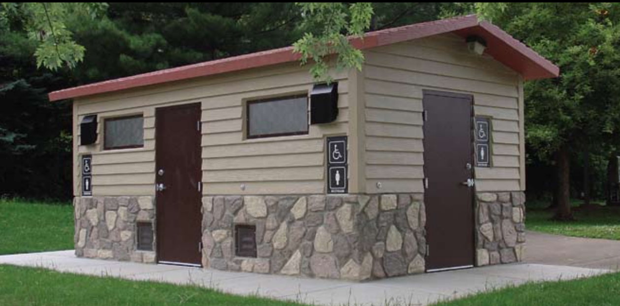
*Shown with optional horizontal lap and Napa Valley Rock textured walls, and standard cedar shake roof.

The Ozark II is a large double flush building that meets all ADA requirements.