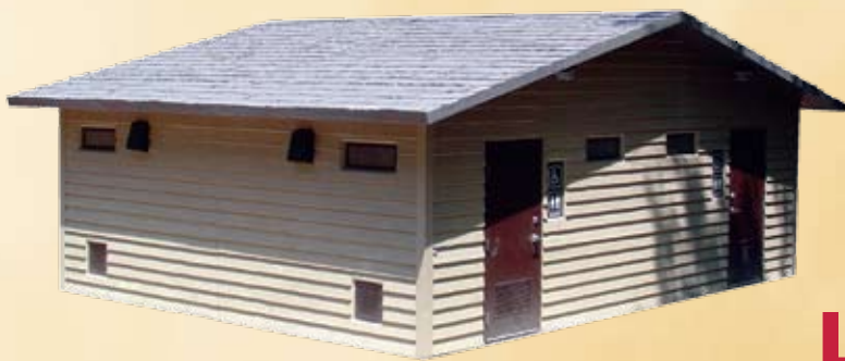
*Shown with optional Board and Batt wall texture and standard cedar shake roof texture.

We at CXT take pride in our craftsmanship and are ready to provide you with our legendary customer service. See why we say, "Once you buy a CXT produced building you will never purchase anything else."