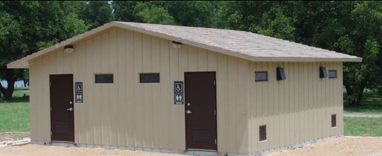
*Shown with optional Board and Batt wall texture and standard cedar shake roof texture.

The Arapaho is a four room family assist style flush shower facility. Each room has its own shower, toilet, and sink. The Arapaho works well in group campgrounds, boat ramps beaches, or any place looking for a multi-user flush facility with individual use rooms. The four individual rooms allows parents to assist there children, or caregivers to assist those under their care. The Arapaho is designed to meet all current American with Disabilities Act requirements. The Arapaho's standard features include sinks, toilets, and interior and exterior lights