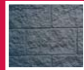
Split Face Block